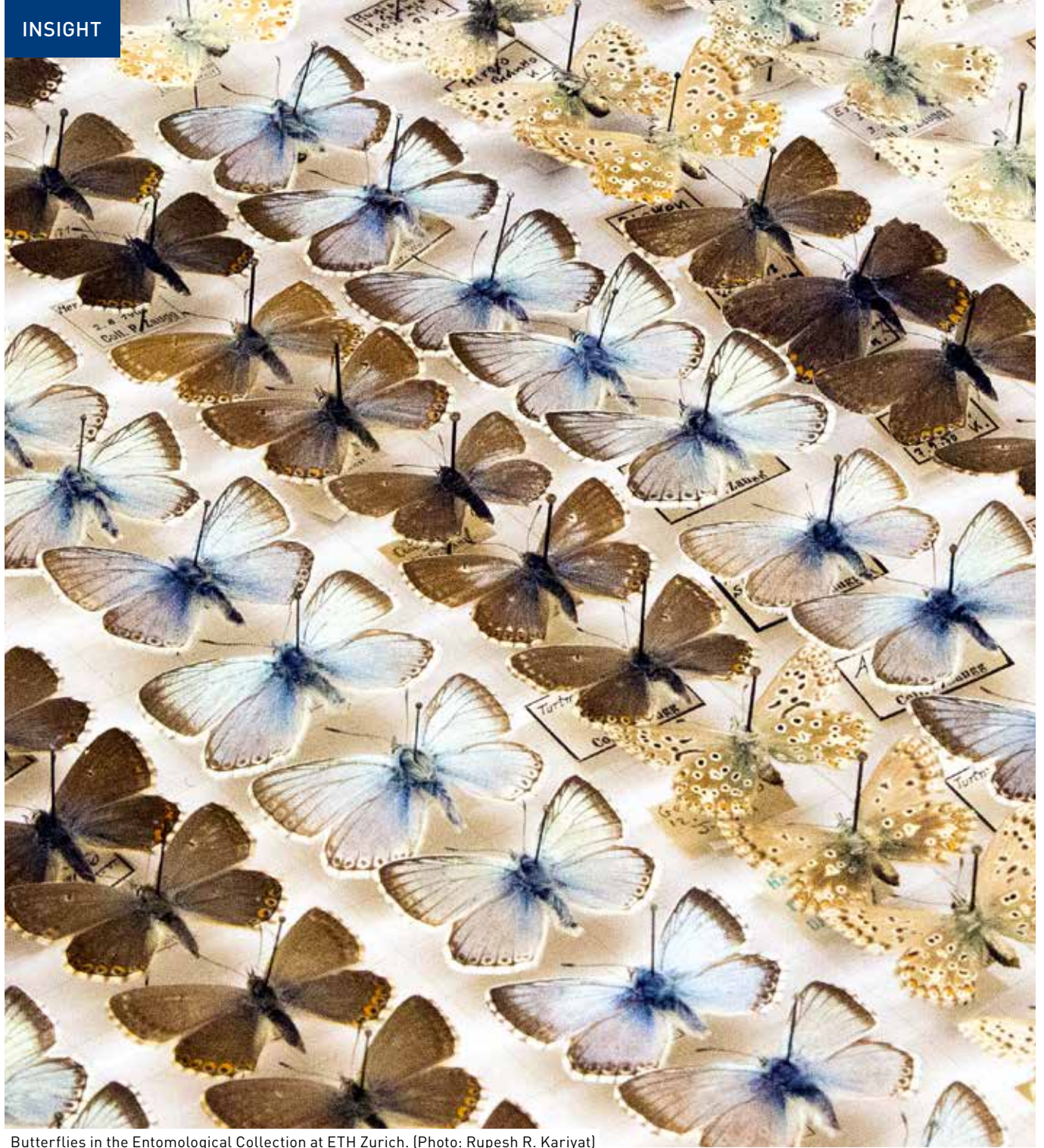
Butterflies in the Entomological Collection at ETH Zurich.